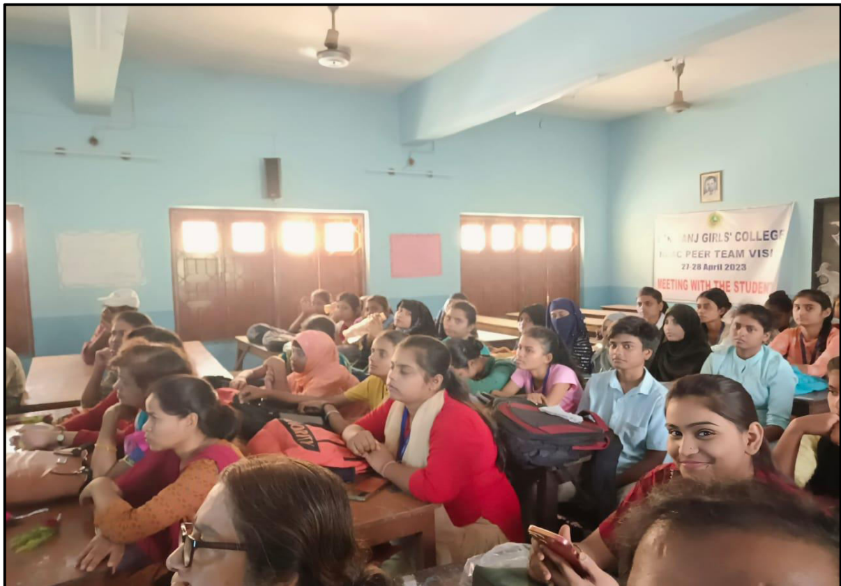
Students and teachers attending the lecture