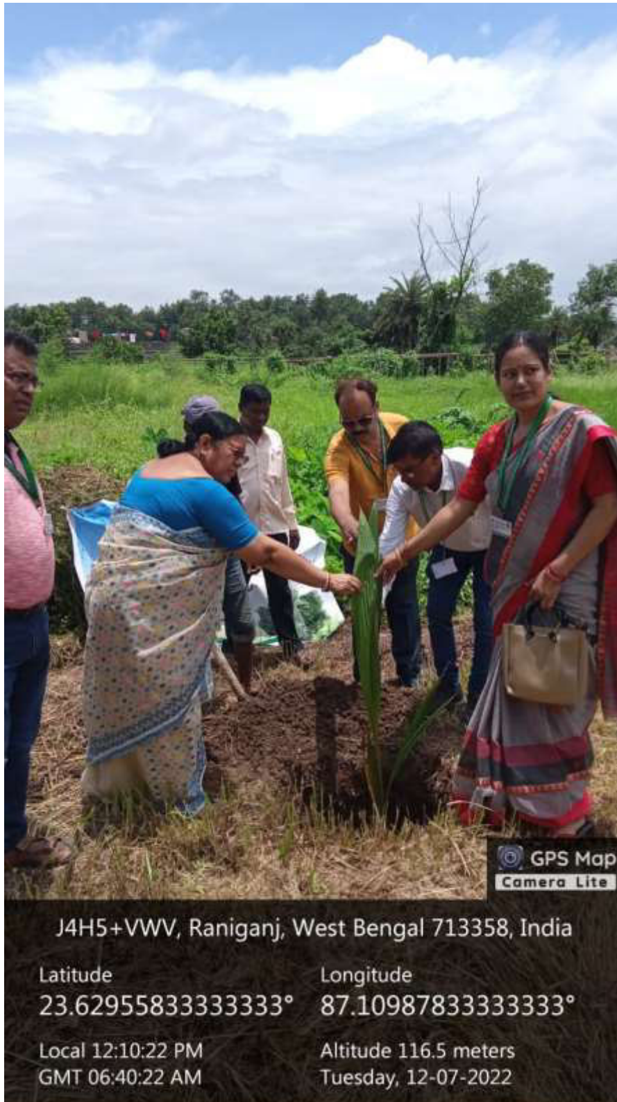
A plantation programme was also carried out in collaboration with Green Club of Raniganj on the same day